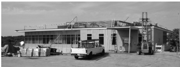
Roxboro City Hall in the Midst of Renovations

Roxboro's City Hall has been undergoing extensive renovations to replace the original roof