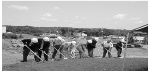
Ground breaking ceremony of the Police Station

“Staff from the UNC School of Government facilitated the entire planning process”