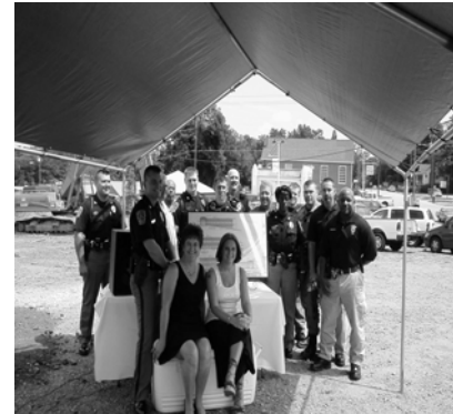
Roxboro Police Department Staff at the Ground Breaking Ceremony of the Police Station